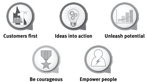
Figure 2: Queensland Public Service Values

The department is committed to the Queensland public service values and our people are encouraged to put our customers first, turn ideas into action, unleash potential, empower each other and be courageous.